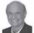
Fred Thompson, Former U.S. Senator Paid AAG Spokesperson