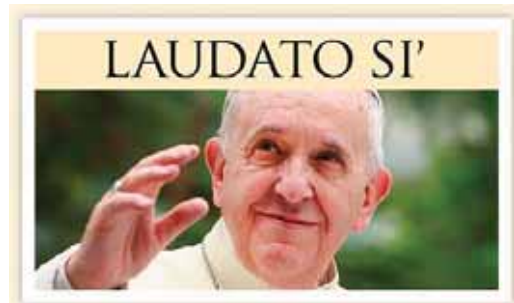
Thinking and Praying with Pope Francis A West Side Deanery initiative