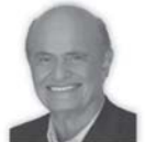
Fred Thompson, Former U.S. Senator Paid AAG Spokesperson