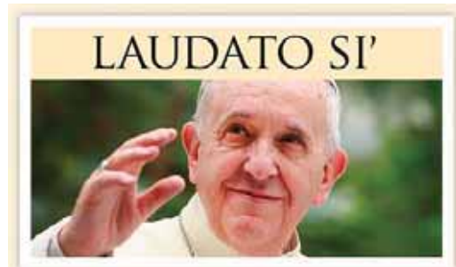
Thinking and Praying with Pope Francis A West Side Deanery initiative